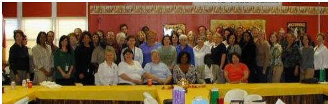
Calcasieu Long Term Recovery Group Member & Participating Organizations

“Light is the task where many share the toil.” Homer