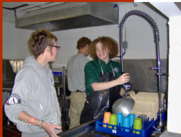
AmeriCorps Team after a hard days work.

made available by the United Way of SWLA Disaster Fund from a donation from Conoco-Phillips in support of recovery after the 2008 hurricanes. Of the requests received, 77 were approved for assistance, 14 were found to be ineligible, 6 were retracted by the caseworker and 4 are pending awaiting the receipt of additional information.